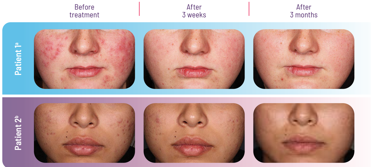
Actual clinical trial subjects. Results may vary. a Study 1 = SC1401. b Study 2 = SC1402.

In clinical trials, SEYSARA started working as early as 3 weeks after starting treatment. 1